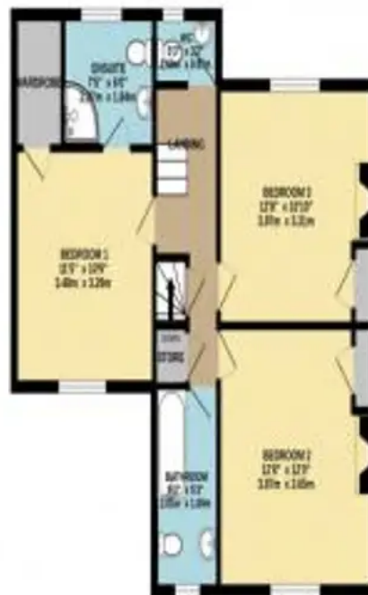
1ST FLOOR 301 sq. ft. (27.9 sq. m.) approx.