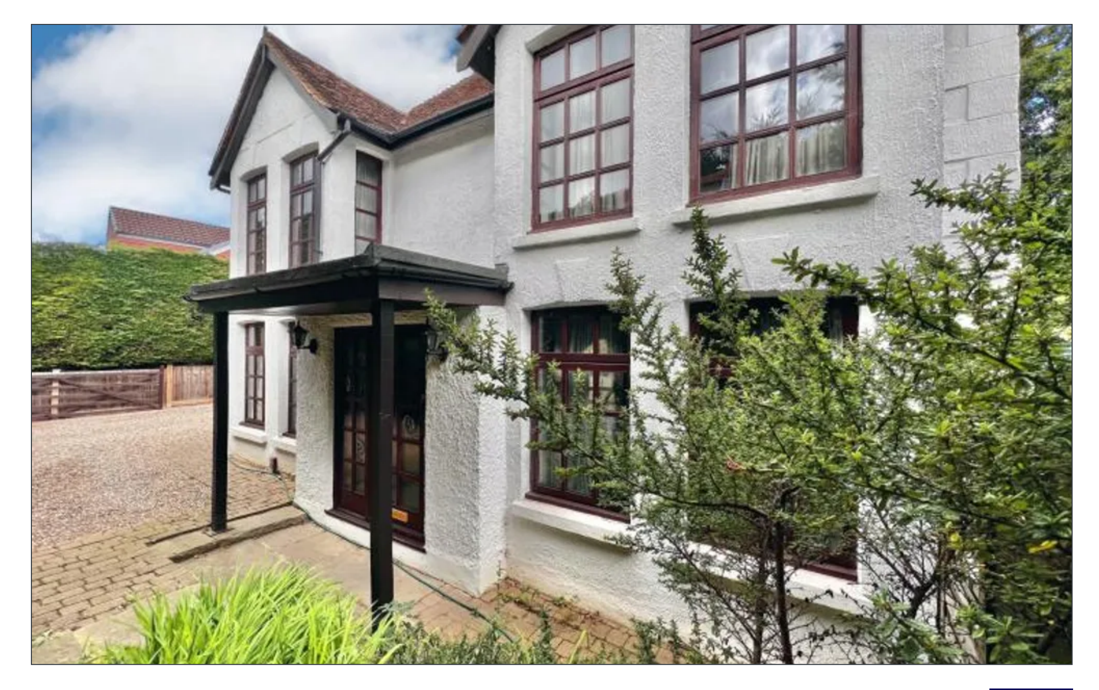
Robin Hood Lane, Walderslade, ME5